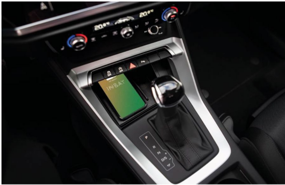
Example of a coupling box in a vehicle display

Vehicles often have a docking box to charge a cell phone. Here, the cell phone lies flat in a recess in the center console.