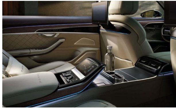
Example Coupling box under the armrest with rear comfort display

The problem is that the cell phone takes up a lot of space in the center console. Which means there is less room for controls or storage. An alternative is to place the coupling box under the armrest.