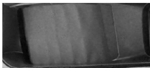
Roller blind in 100% closed position at 50km/h