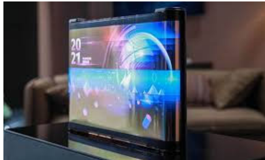
Figure 1. Drawing of rollable display design

The problems/challenges of rollable display is made by plastic films, polyimide for example as fig.1 shows. so is very soft and lack of supporting. And after rolling, there is trace mark or warpage in the rolling area due to the plastic materials are deformed.